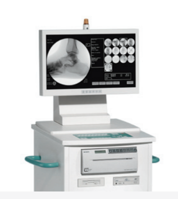
High-resolution flatscreen monitors provide clear, high-contrast images.