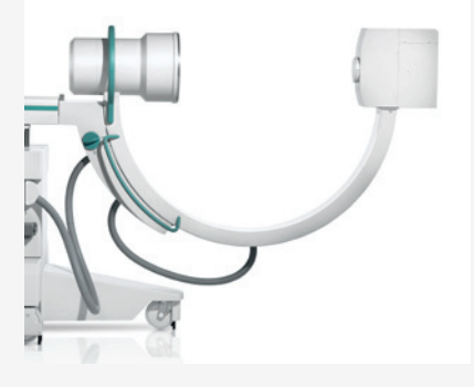
Ziehm 8000 is characterized by its small footprint and unmatched mobility.

Ziehm 8000's anatomical programs ensure optimum image quality.